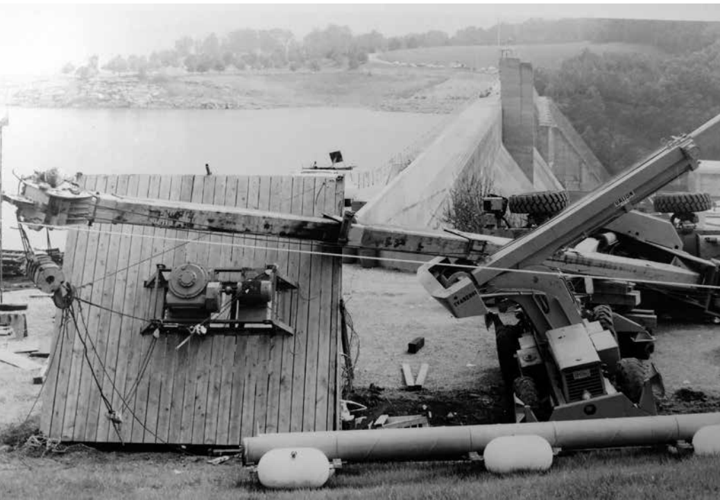
Figure 1. Overturned crane and smashed equipment at Douglas Dam.