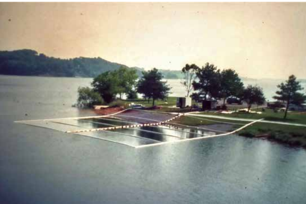
Figure 4. PVC frame diffuser.

curvilinear channel and is still in use today.