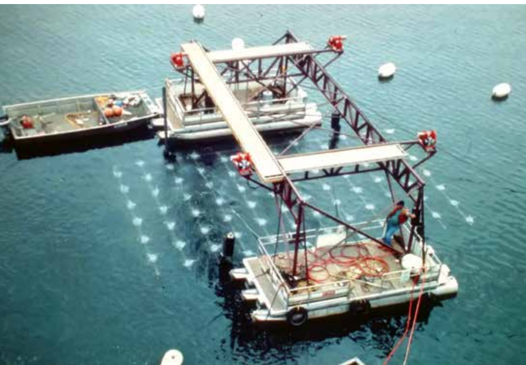
Figure 2. Compact diffuser design.

72-percent oxygen transfer efficiency, but the strong bubble plumes stirred up and entrained bottom sediments that increased oxygen demands, eventually zeroing out our overall DO addition and clogging the raw water cooling system in the hydro plant (Figure 3). I was not popular with the plant operators.