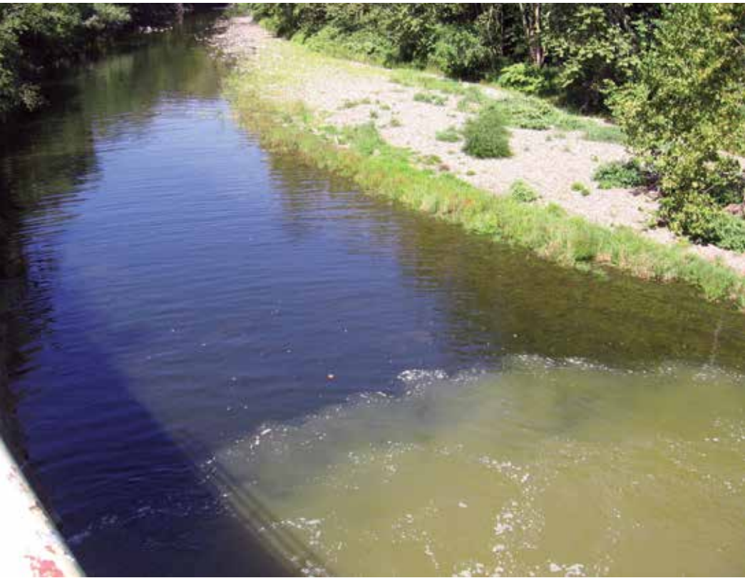
Figure 5. Turbid hydropower release into the Lackawaxen River.

installation in Falling Creek Reservoir for the Western Virginia Water Authority in 2012, a team from MEI, Gantzer Water Resource Engineering and Burgess & Niple extrapolated the design for a much larger system for the Wolf Creek Reservoir for the City of Barberton Ohio in 2015.