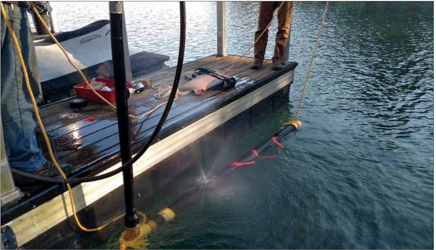
Figure 7. Nozzle test.

year, we modified the distribution piping with additional piping and new nozzles. Results were much improved with the lowest Mn levels yet measured, but the oxygen supply equipment suffered a long term shutdown and we will have to wait until the system is fully operational again to claim complete success with this design.