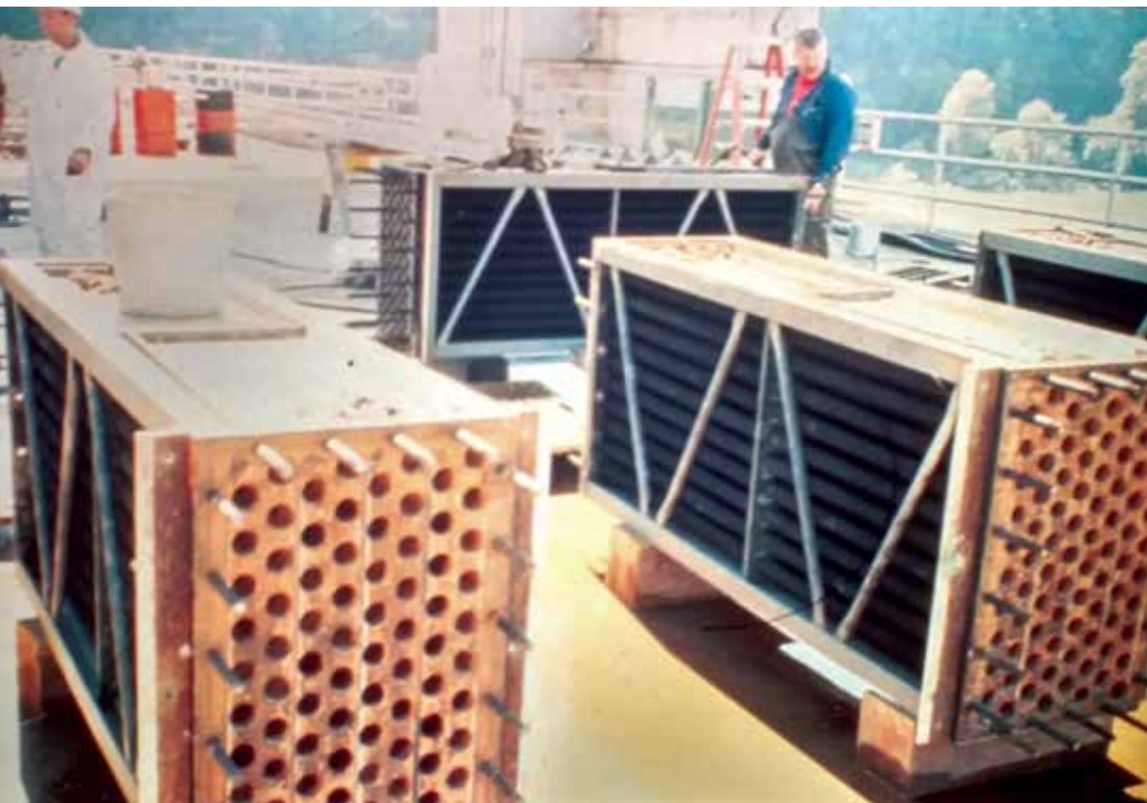
Figure 3. Manual cleaning of raw water heat exchangers.